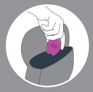
Once satisfied, push the sides together for compact, discreet storage in your bag or purse.

Use the double-peaked side of the pop-up vibe for pinpointed vibrations. Place the peaks on either side of the clitoris for a unique sensation.